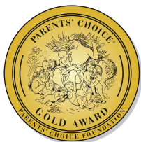
Parents' Choice GOLD Award