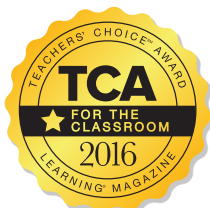
Teachers' Choice Award For The Classroom