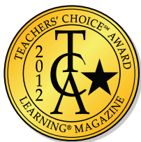
Teachers' Choice Award