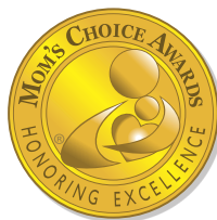
Mom's Choice Award GOLD