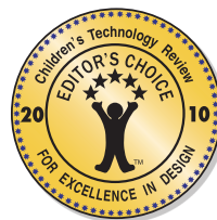
Editor's Choice Award

“ABCMouse.com is an extensive curriculum resource that helps teachers of young children provide for the academic needs of individual students in their diverse classrooms, and at the same time is a powerful teaching tool that incorporates best practices in early childhood education . It is a resource that I can enthusiastically recommend to preschool, pre-k, kindergarten, and first grade teachers across America.”